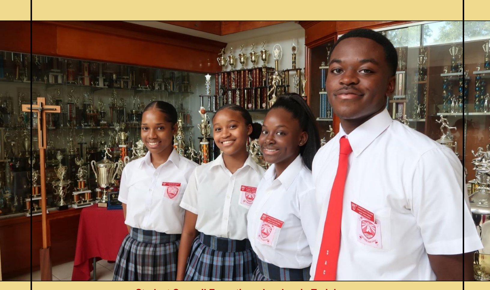
Student Council Executives: Leaders in Training

Finally, students sit the Microsoft Office Specialist Certification Exam for Microsoft Word, Excel, and PowerPoint in the tenth, eleventh and twelfth grades, respectively.