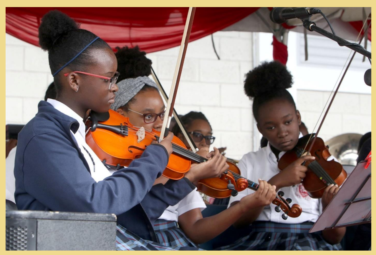
Students Excelling in the Arts