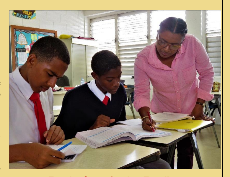
Faculty Committed to Excellence

The new Principal will be one who is able to engage dialogue across subject disciplines, from a broad perspective, and is thus respected by members of the teaching staff as well as parents and the wider public. An instructional leader committed to supporting all students, the successful candidate will have the ability to articulate and advocate for the creation of conditions necessary for setting high standards and improving the achievement of all students. Toward this end, the new Principal will be charged with engaging faculty to ensure that curricula programming is kept current with the rapidly changing world and student needs, and that students' full potential is realised.