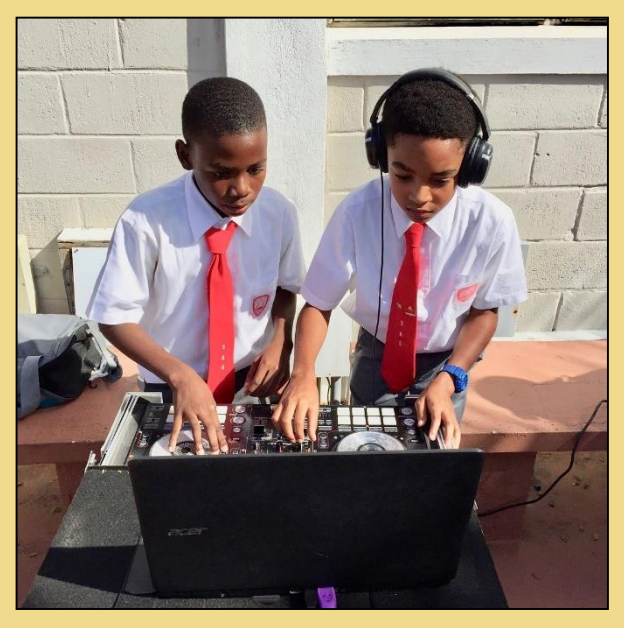
Preparing Students to Engage Technologically

Representatives from the SAC campus community, alumni, as well as the leadership of the Board of Directors, Members of the College and Office of the Archbishop were engaged through a survey questionnaire and focus group sessions to discern the qualities sought in this next leader. What emerged were the following traits desired for the new Principal.