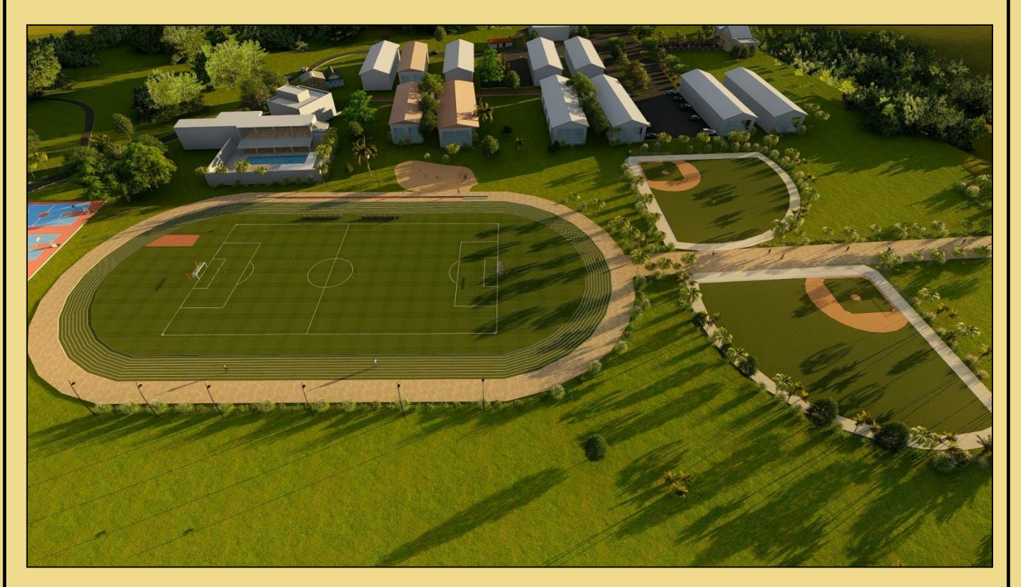
Field of Dreams: Campaign for Expansion (Video by Parish Guillaume '08)

In keeping with the increased enrolment, fluctuating just over 800 to 1,020, and to meet the expanded course electives, ongoing efforts have focussed on infrastructural enhancements to meet the students' needs and preparation for a modern, technological society and challenges that lie ahead. When the 140's block, which housed the staff room, a biology lab and classrooms, was destroyed by fire in February 2000 a refurbished building was constructed and re-dedicated in November 2001. The building is now called The Benedictine Building in honour of the many Benedictine monks that have served the College from its inception.